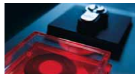
Security/Time and Access Control (STA)