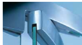
Glass Fittings and Accessories