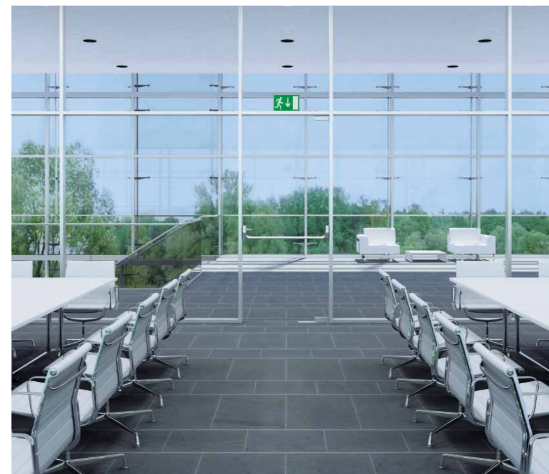
An impressive integrated solution for a conference facility, the PHA 2000 also harmonises well within the single-leaf toughened glass door.

For buildings in which the occupants are familiar with their surroundings, DORMA is also now able to offer an ideal hardware solution for toughened glass emergency exit doors: the Exit Pad.